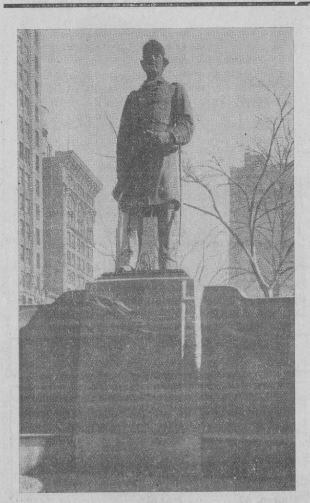
Statue of Admiral Farragut, Madison Sq., New York City

PERFUMERIA INGLESA CADENA, 6 TEL.. 1770 LARGE ASSORTMENT OF ALL BEST FOREIGN PRODUCTS