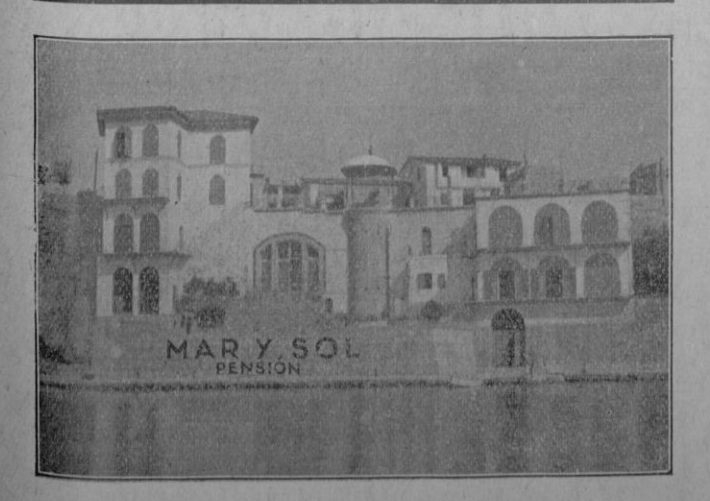
Pedregal 29 Son Alegre Telephone 1194 Beautifully situated at the water's edge. Dining terraces overlooking the sea. Running water in every room. All conveniences. Excellent cuisine.

for good music, good food, good drinks and a lively crowd Come and dance in the evenings in the cool and charming Hotel Bellver Garden