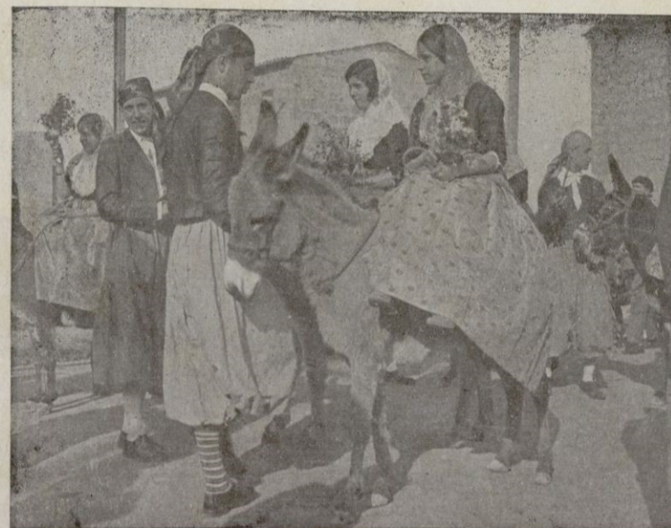
The start of a pilgrimage from a Mallorca village in olden times.

Greetings by the Governor and the Mayor. Last Week in Majorcan History. Cruise Boats. British and American Consulates. Exchange of the Week. Extended Telephone Service. Telegraph Service. Rock of Gibraltar. Another Speed Record for England. Church Services. The Colony with Hotel Registration. Attractions of the Coming Week. Exhibitions at Palma. Latest News.