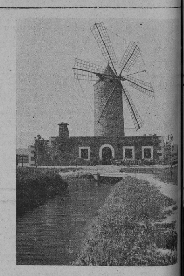
The club house of the only golf course in Mallor

BATHING, BOATING, AVIATION, FISHING, GOLF, TENNIS, RIDING