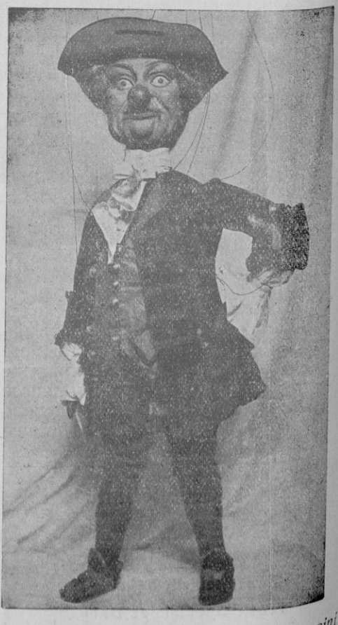
Character from «The Magpie» of Ross<sup>ini</sup>