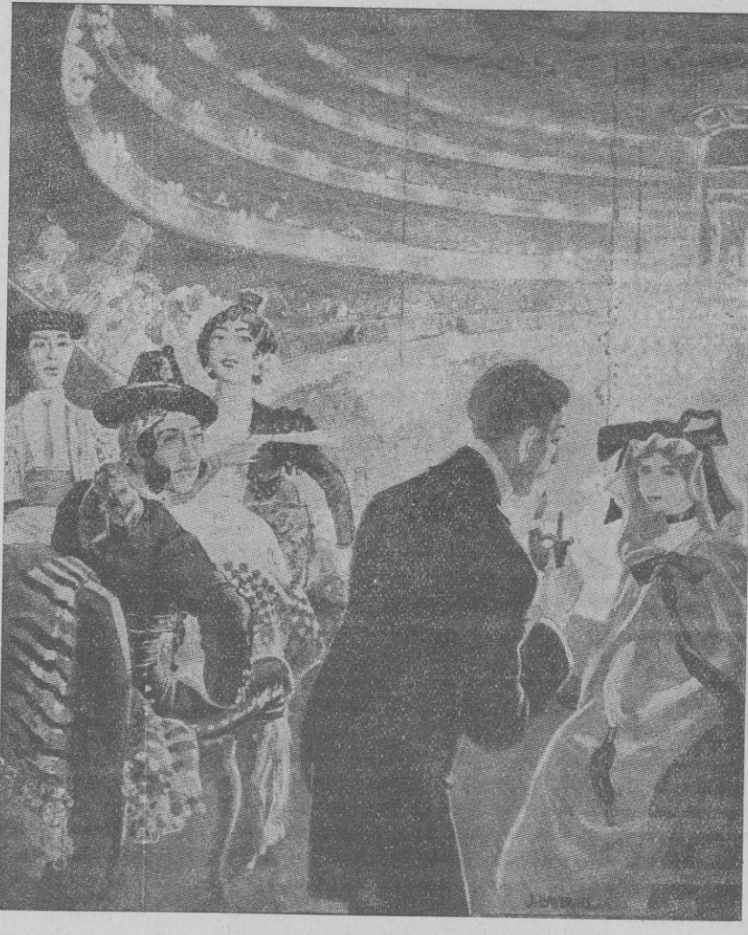
An Artisi's View of the Barcelona Opera House

Custom and habit are part and parcel the Liceo tradition. The young men