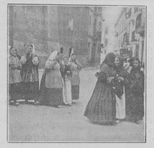
Sunday in Ibiza

PEREYRA THEATRE rmances Twice Weekly English-Spanish