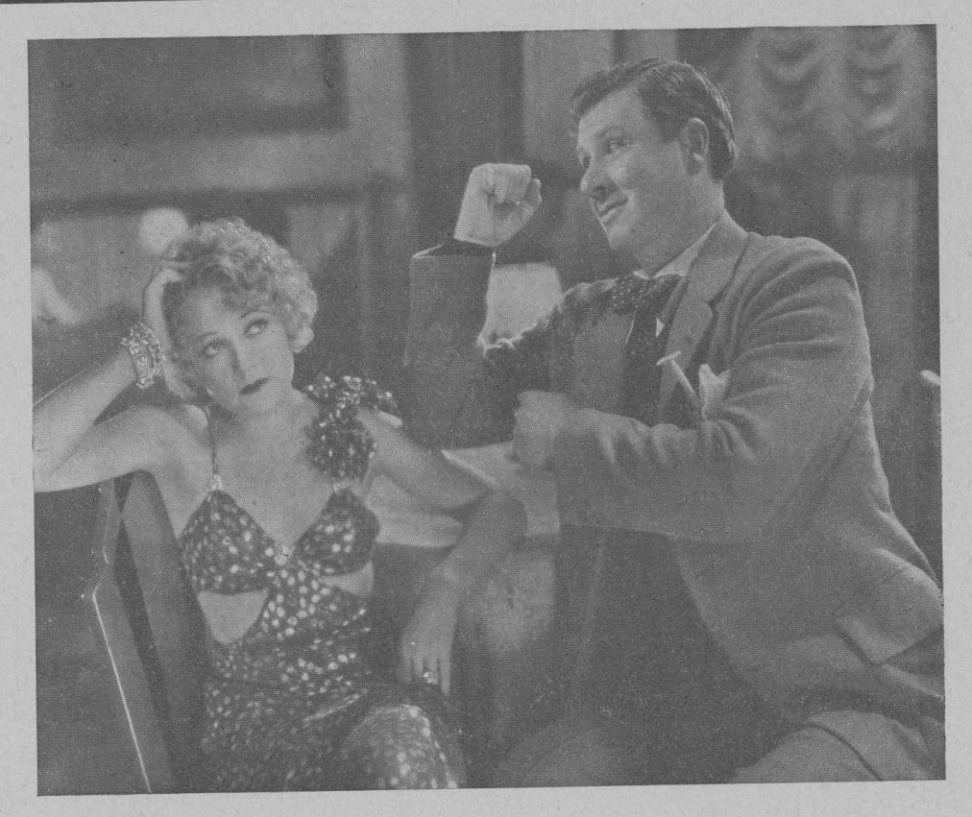
George Bancroft and Wynne Gibson in Lady and Gent

Railway station. The Rome Express ready to start. People who say good-bye to their parting friends. The train begins to move; two men jump